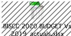
BISSC 2020 BUDGET vs 2019 actuals.xlsx