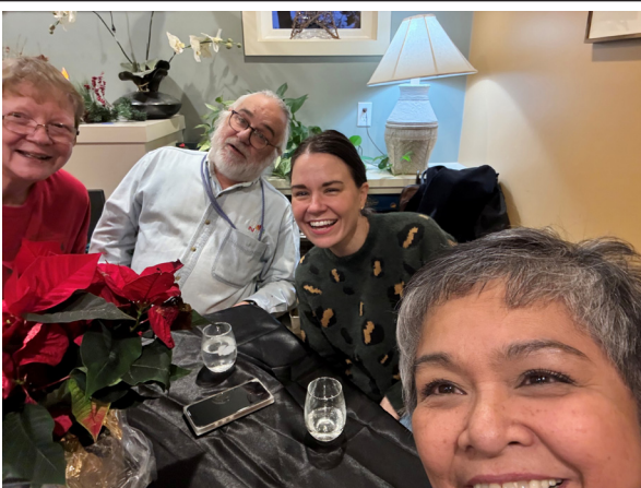
See anyone you know?

There will be an online discussion of these images with the photographer in February. The link will be on the Senior Center/Community Center website and in their newsletter in early February.