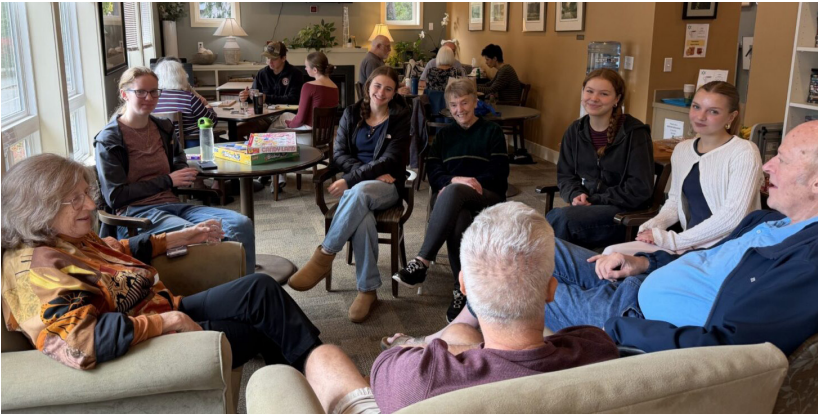
BHS kids visit BISCC