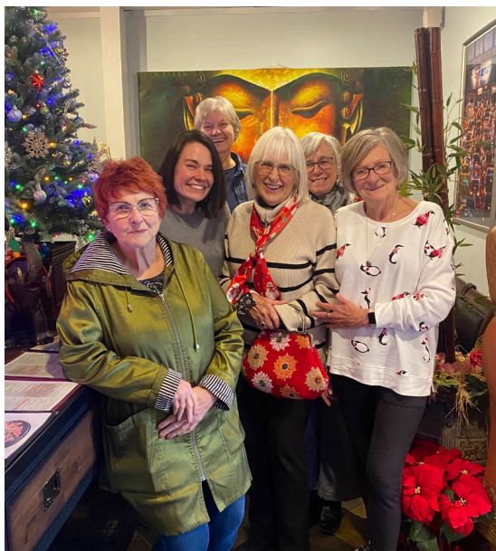
BISCC's Fundraising Committee (emphasis on the FUN) out to lunch at Ginn D Thai Restaurant in Lynwood Center