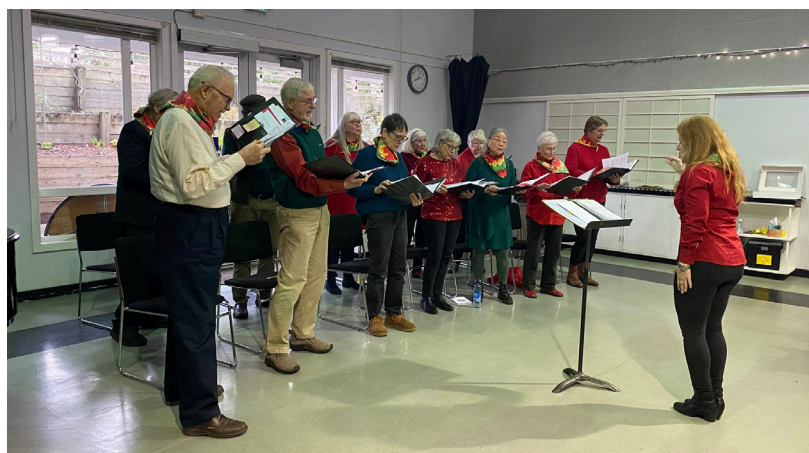
Evergreen Singers Concert