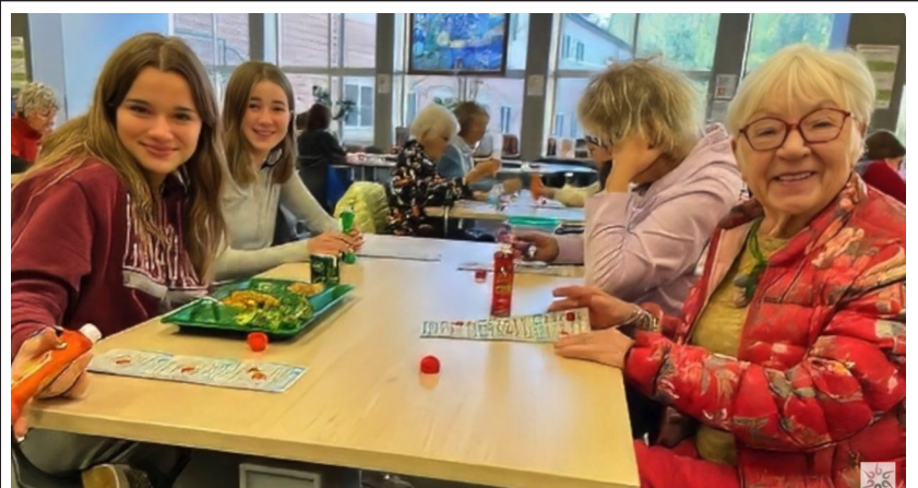
Bingo with the teens!