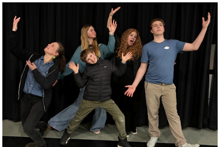
Chive Mind performance at BISCC