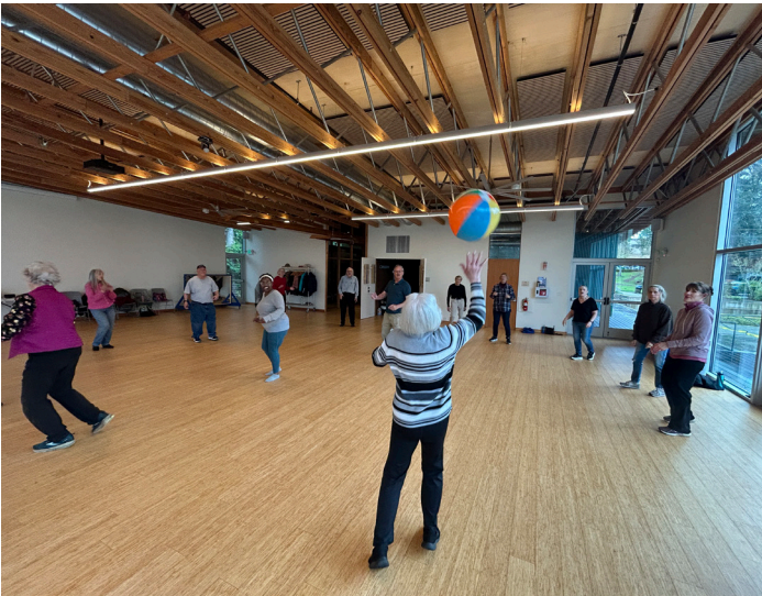
Celebrating the Beach Boys at Friday Line Dancing