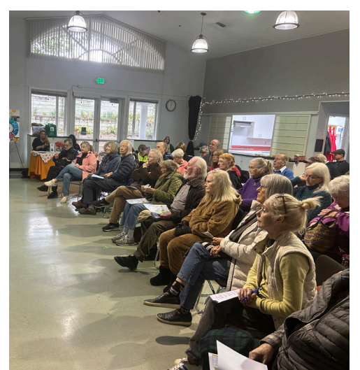
Aging in Place Forum