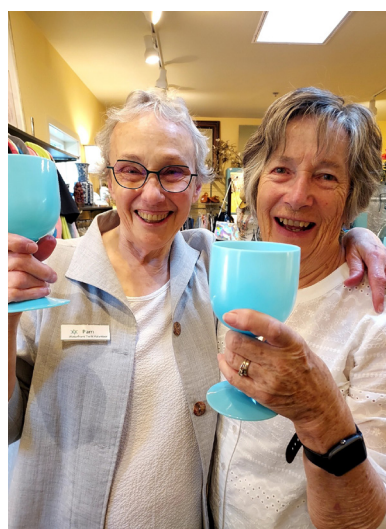
Thrift Shop Friends!