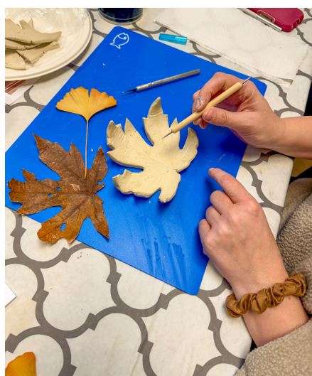
Art Workshop Fun!