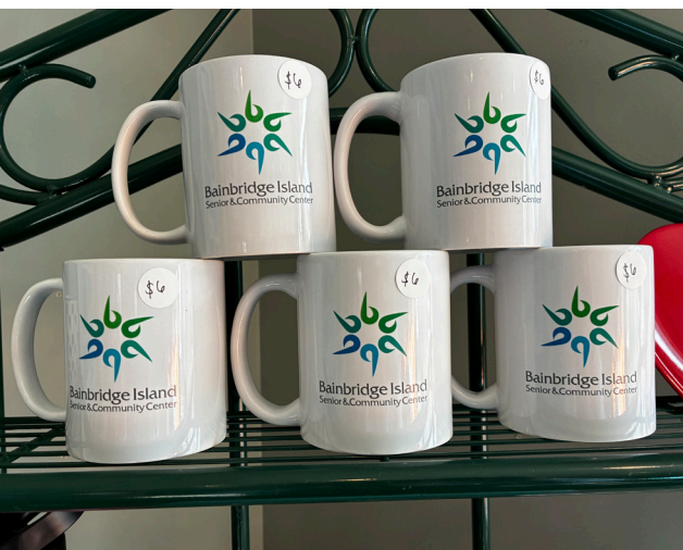
Your very own BISCC mug is waiting for you! $6 at Waterfront Thrift